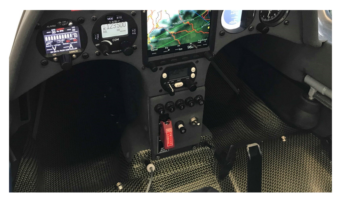
On Duo Discus FES, front "Power switch" is located on the left side of lower console.

The "FES Power switch" enable or disable motor power. On two-seater gliders there are two FES power switches. One in front cockpit and one in rear cockpit.