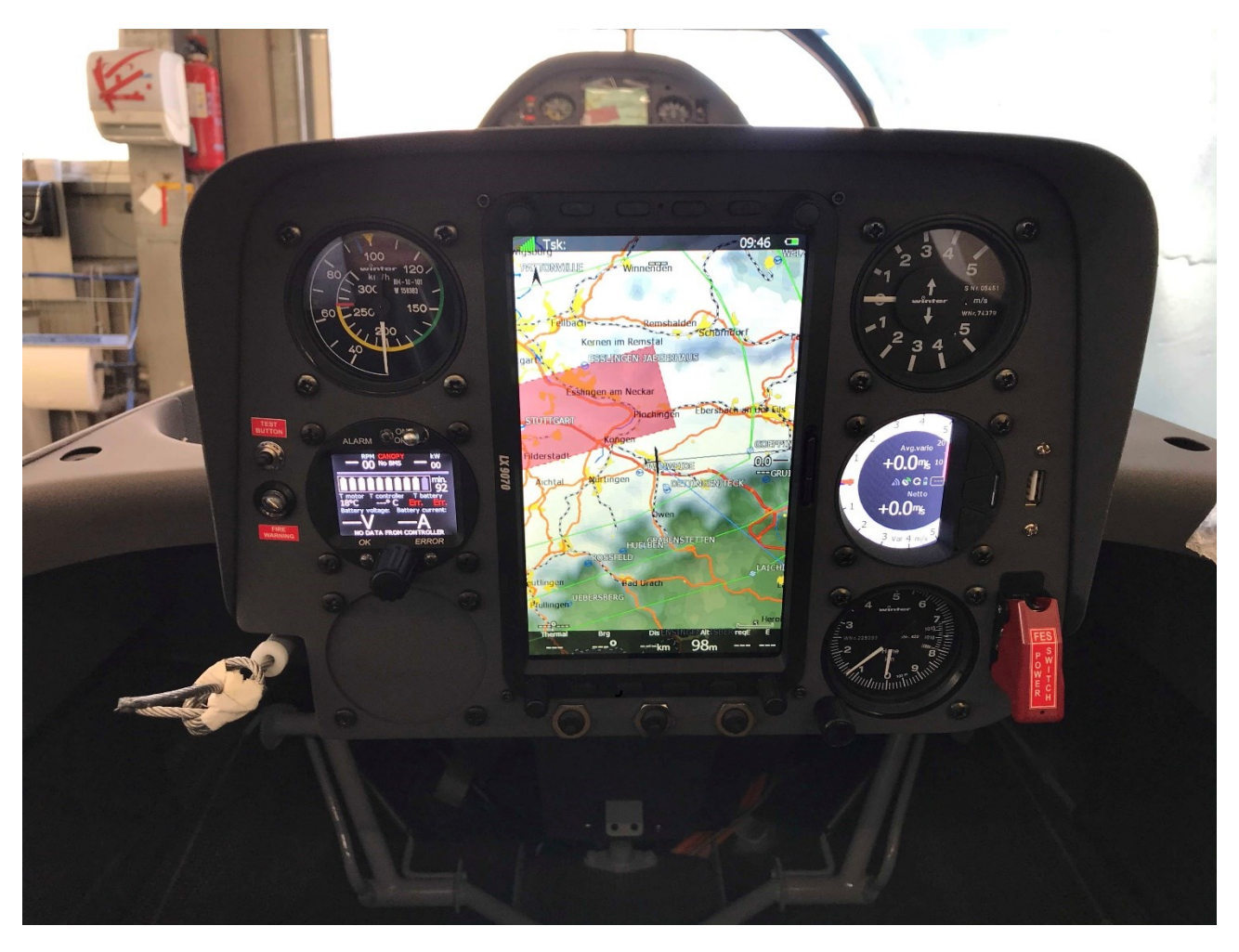
Suitable position for the FCU instrument Repeater on the rear panel of Duo Discus FES