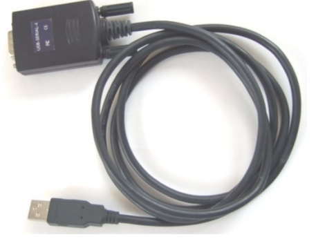
Standard USB-RS232 cable