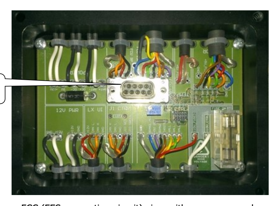
FCC (FES connecting circuit) view with cover removed.