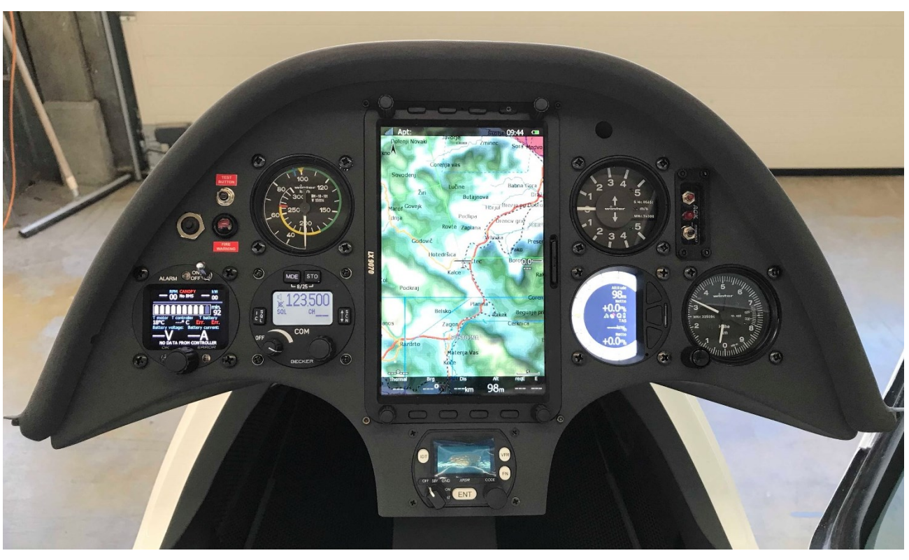
Suitable position for the FCU instrument Master on front panel of Duo Discus FES