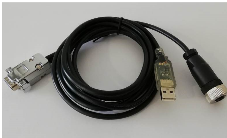
FES KOP605 BMS-Charger-PC cable