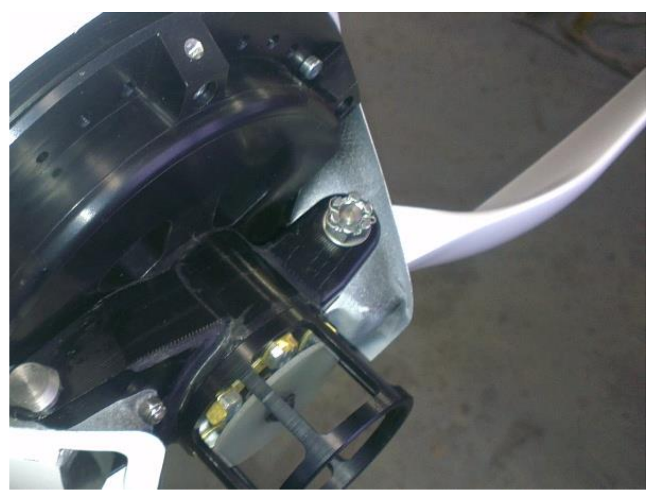
Fig.1 Propeller blades mounting on the holder