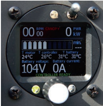
FES control unit

Below: Andy Aveling was particularly impressed with performance in the speed flap setting