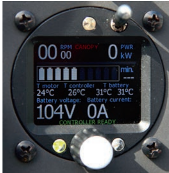
FES control unit

Below: Andy Aveling was particularly impressed with performance in the speed flap setting